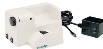
74352 (EUR) 74354 (UK)