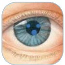
Small pupil mode